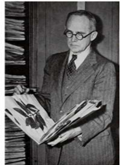
In the Arboretum's Herbarium c1940s