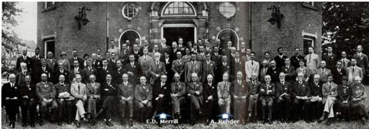
Sixth International Botanical Congress, Amsterdam, September 1935. Plant Taxonomy Section