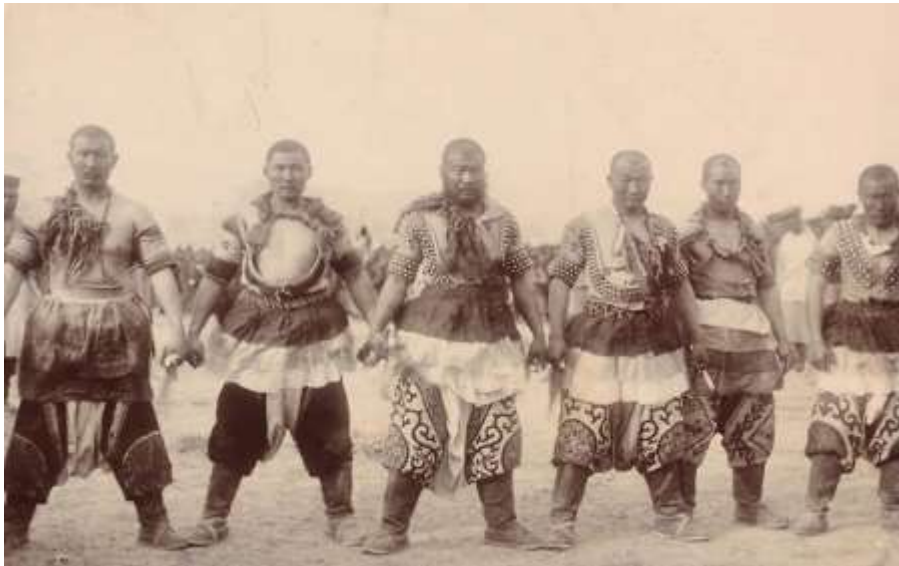
Chinese strong men. August, 1909