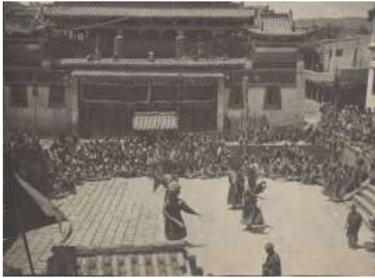
"Devil dancing" at Chone. July, 1911