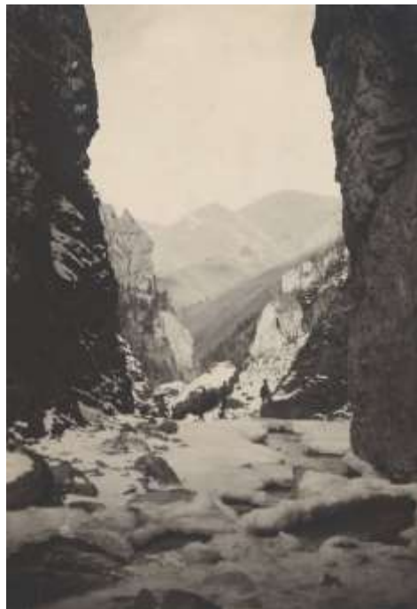
Peling Range Ravine. Fall, 1911