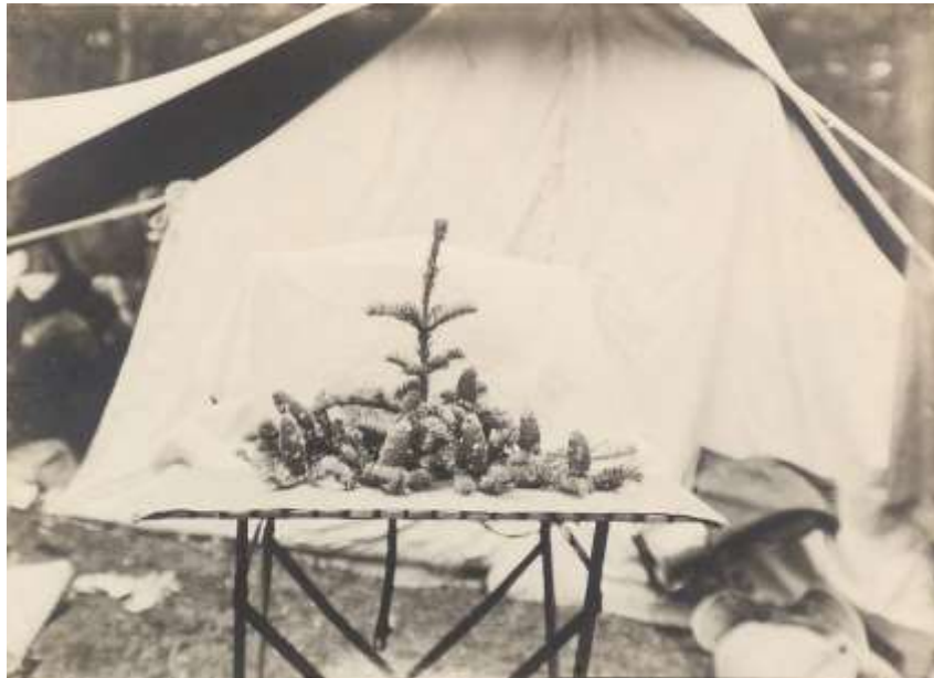
Abies nephrolepis . September, 1909