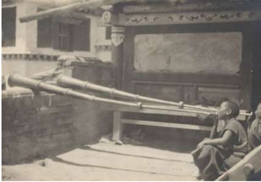
Chone Monastery. July, 1911