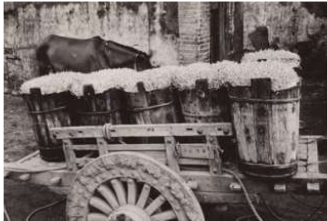
Phaseolus aureus . Peking, China. A cart full of tubs of bean sprouts, produced by the humble mung bean. These bean sprouts are eaten as a vegetable, when scalded, and they are a very tasteful product when served cold as salad with some soy-bean, vinegar and oil sprinkled over them. Sixteen or seventeen catties of dry beans supply from fifty to sixty catties of sprouts. June 28, 1913, photograph by Frank Meyer

The Arnold Arboretum's Frank N. Meyer photograph collection consists of approximately 1,600 various sized black and white photographs mounted on boards, often with several images mounted together on one board, and 150 small, various sized, black and white sleeved photographs. The mounted images include Meyer's detailed descriptions on the verso. The images are filed in the Arboretum's historic photograph collection with photographs of specific plants filed alphabetically by genus and species and general subjects filed alphabetically by country then by local place name. In 2005, the Arboretum digitized 1,344 Meyer's images of eastern Asia. Information on how to search for and view Meyer's images and their metadata in the Botanical and Cultural Images of Eastern Asia, 1907-1927 collection.