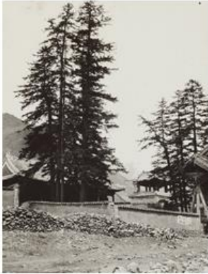
April 24, 1907