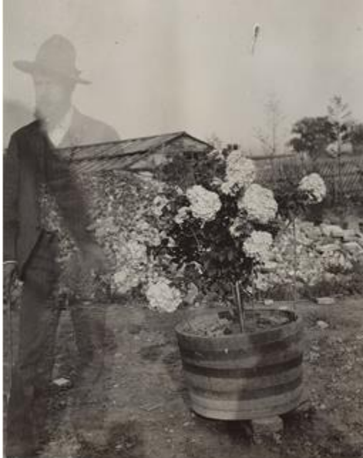
Viburnum macrocephalum . Grown in tub; could be utilized very well as a decorative plant by our florists. It does not stand any great cold. Shanghai. May 4, 1908, photograph by Frank Meyer [photograph is double exposed and includes an image of Meyer]

In 1914, in Plantae Wilsonianae , Alfred Rehder and Ernest Henry Wilson would describe and name a new species of spruce, Picea meyeri based on the specimen Meyer collected on February 25 th 1907. The April 24, June 1, and February 26 images were all then identified as Picea meyeri and the Harvard University Herbaria holds the holotype , the specimen used by Rehder & E. H. Wilson to identify the species.