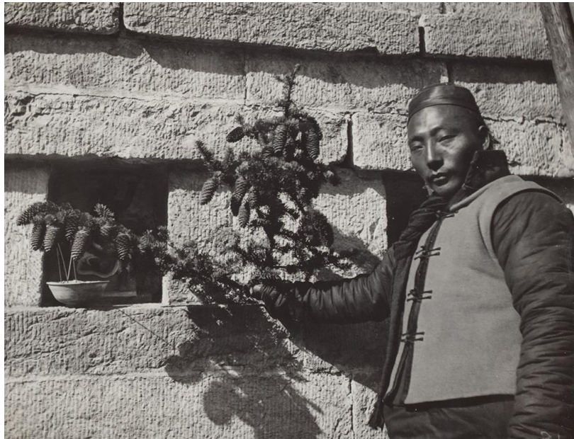
February 26, 1908