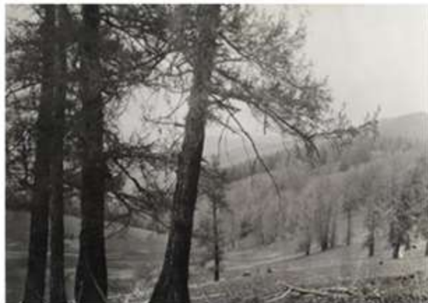
Siberia, Altai. As we march further north we pass a rolling country, June 9, 1911