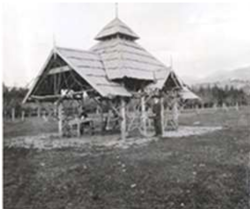
Russian Caucasus. Tea house on an imperial estate, Chakva, where one may order a cup of tea, February 23, 1910, photograph by Frank Meyer

As of 2012, most the Arboretum's holdings of Meyer's photographs of central Asia have not been digitized. However, although it may not be a complete record, a searchable list is available of Meyer's images taken in parts of Russia, Siberia, Mongolia, Turkestan, and the United States and includes date, country, plant name, and description of the image. The description of the image usually includes plant name(s), more information about the plant(s), Meyer's observations on the subject, a detailed location where the picture was taken, and its date. The following eight images are a representative sampling of Meyer's images of central Asia.