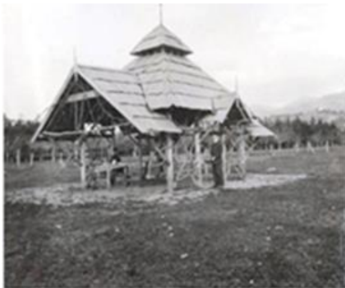
Russian Caucasus. Tea house on an imperial estate, Chakva, where one may order a cup of tea, February 23, 1910

As of 2012, most the Arboretum's holdings of Meyer's photographs of central Asia have not been digitized. However, although it may not be a complete record, a searchable list is available of Meyer's images taken in parts of Russia, Siberia, Mongolia, Turkestan, and the United States and includes date, country, plant name, and description of the image. The description of the image usually includes plant name(s), more information about the plant(s), Meyer's observations on the subject, a detailed location where the picture was taken, and its date. The following eight images are a representative sampling of Meyer's images of central Asia.