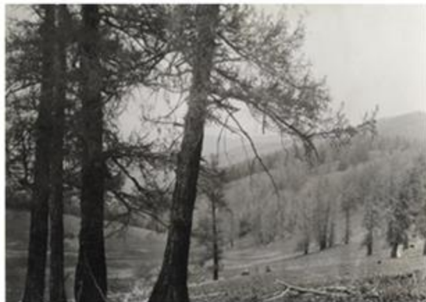
Siberia, Altai. As we march further north we pass a rolling country, June 9, 1911