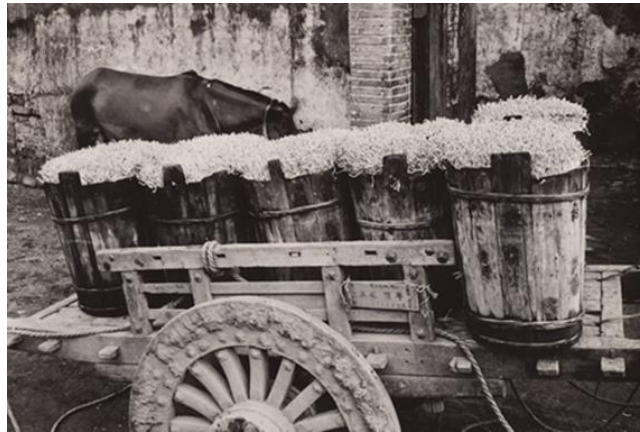
Phaseolus aureus . Peking, China. A cart full of tubs of bean sprouts, produced by the humble mung bean. These bean sprouts are eaten as a vegetable, when scalded, and they are a very tasteful product when served cold as salad with some soy-bean, vinegar and oil sprinkled over them. Sixteen or seventeen catties of dry beans supply from fifty to sixty catties of sprouts. June 28, 1913

The Arnold Arboretum's Frank N. Meyer photograph collection consists of approximately 1,600 various sized black and white photographs mounted on boards, often with several images mounted together on one board, and 150 small, various sized, black and white sleeved photographs. The mounted images include Meyer's detailed descriptions on the verso. The images are filed in the Arboretum's historic photograph collection with photographs of specific plants filed alphabetically by genus and species and general subjects filed alphabetically by country then by local place name. In 2005, the Arboretum digitized 1,344 Meyer's images of eastern Asia. Information on how to search for and view Meyer's images and their metadata in the Botanical and Cultural Images of Eastern Asia, 1907-1927 collection.