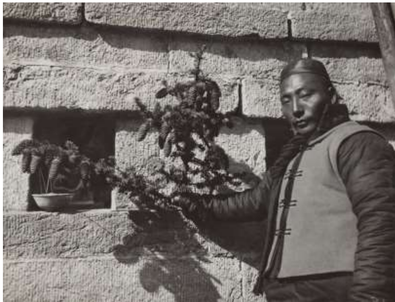
February 26, 1908