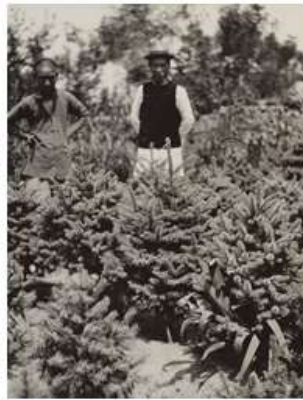
June 1, 1907