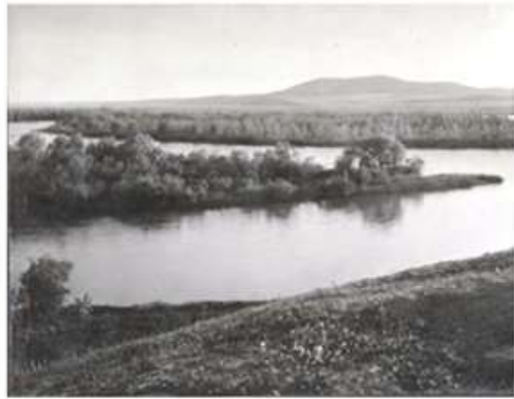
Two Views: Siberia, Irtysh River. The beautiful scenery along the Irtysh River. With the irrigated vegetable gardens of Krasnoyarsk lying at the foot of the cliffs, this is an arid country and it is only where water is in reach of the roots that one finds trees of any size. September 29, 1911, photographs by Frank Meyer