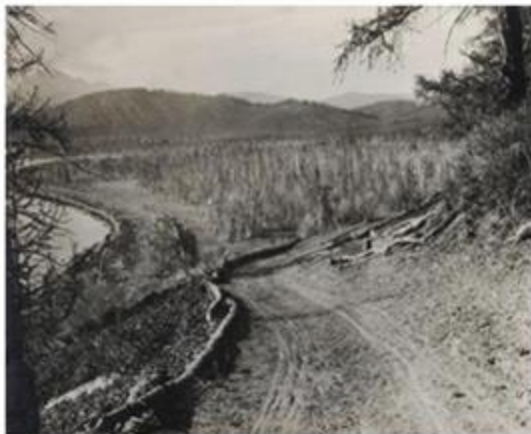
Siberia, Altai. The road leads north and Northeast, June 11, 1911