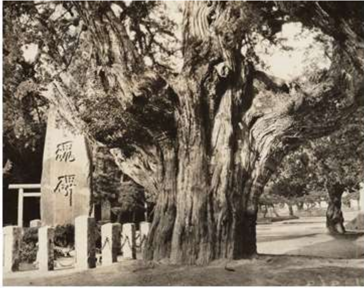
Juniperis chinensis. Kamakura, Japan. A remarkably large specimen of Chinese juniper in the grounds of the Kenchoji (?) temple, many centuries old. September 15, 1915