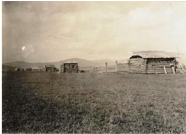
Siberia, Alati, The Russian settlement of Ak-Selan, June 6, 1911