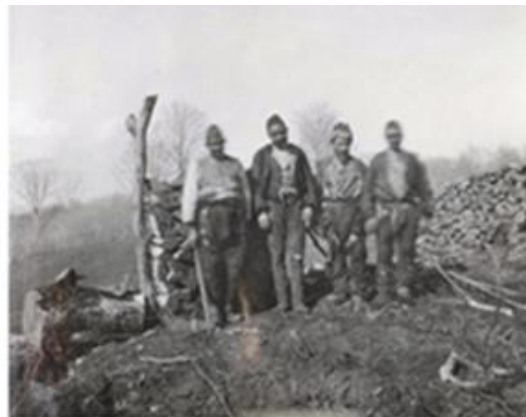
Russian Caucasus, A motley crew of woodchoppers. These men are mainly Turks, hardworking and sober, but they do not earn much over 60 to 80 Ropesks per day, Chakva near Batorim, February 23, 1910