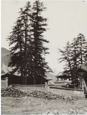
April 24, 1907