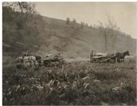
Siberia, Alati, Our camping place near some tall larches, June 7, 1911