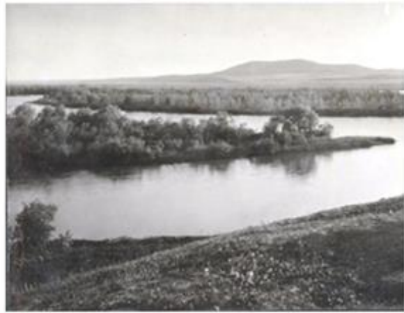
Two Views: Siberia, Irtysh River. The beautiful scenery along the Irtysh River. With the irrigated vegetable gardens of Krasnoyarsk lying at the foot of the cliffs, this is an arid country and it is only where water is in reach of the roots that one finds trees of any size. September 29, 1911