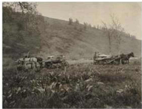
Siberia, Alati, Our camping place near some tall larches, June 7, 1911, photograph by Frank Meyer