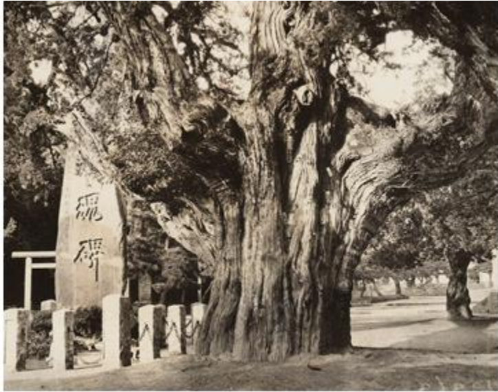
Juniperis chinensis. Kamakura, Japan. A remarkably large specimen of Chinese juniper in the grounds of the Kenchoji (?) temple, many centuries old. September 15, 1915