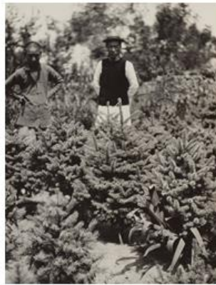
June 1, 1907