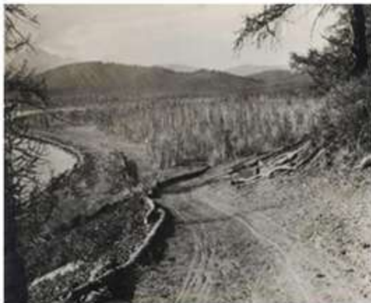
Siberia, Altai. The road leads north and Northeast, June 11, 1911