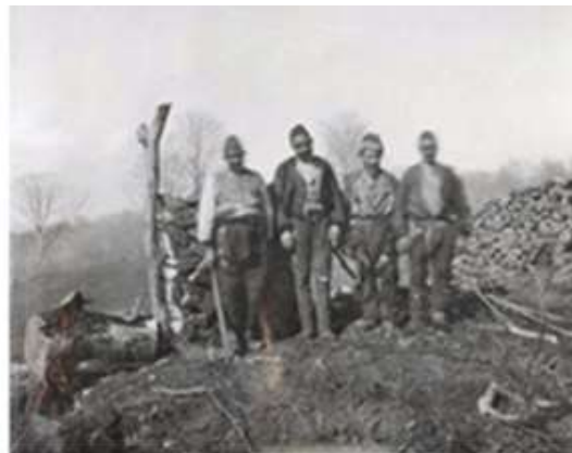
Russian Caucasus, A motley crew of woodchoppers. These men are mainly Turks, hardworking and sober, but they do not earn much over 60 to 80 Ropesks per day, Chakva near Batorim, February 23, 1910