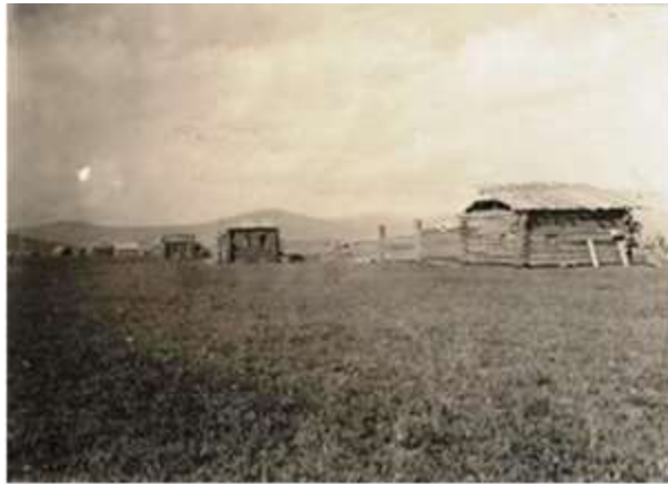
Siberia, Alati, The Russian settlement of Ak-Selan, June 6, 1911