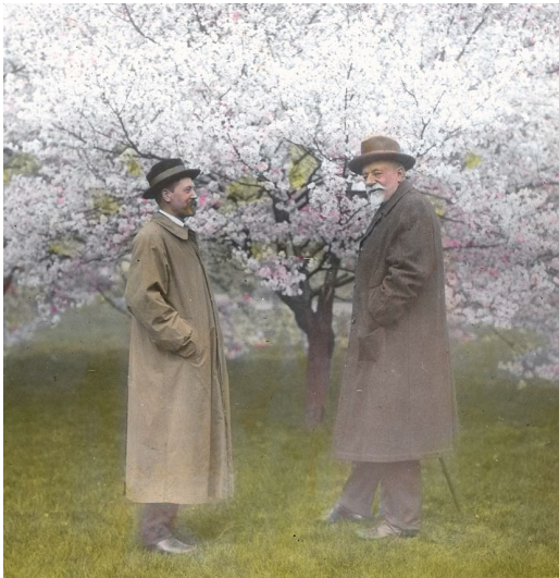
Charles S. Sargent and Ernest H. Wilson standing in front of a Higan Cherry tree ( Prunus subhirtella), 1915.

Charles Sprague Sargent (1841-1927) was the first director of the Arnold Arboretum and served the institution for over 54 years. Born to a prominent Boston merchant family, his unique vision, horticultural knowledge, publications, commitment to education, and tenacity led to the creation of the first public arboretum in North America, along with its library, herbarium, and prominence in the history of Boston. As the penultimate link in The Emerald Necklace, a network of public parkland designed by Frederick Law Olmsted, the Arnold Arboretum continues through the seasons as a living testament to the Sargent legacy.