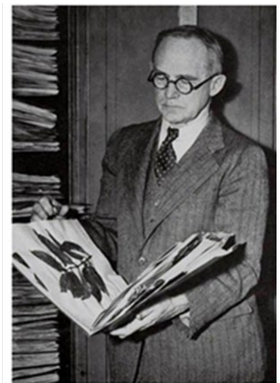
In the Arboretum's Herbarium c1940s