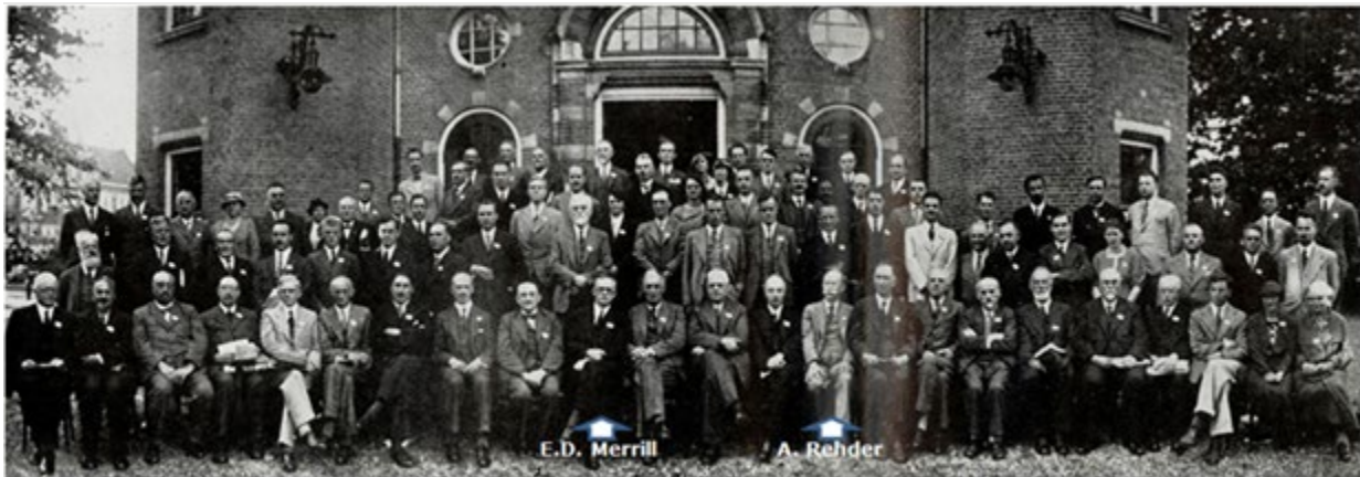
Sixth International Botanical Congress, Amsterdam, September 1935. Plant Taxonomy Section