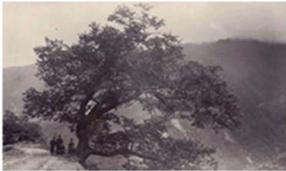
Castanea japonica . Japan. September 2, 1902.

Soon after Jack joined the Arboretum he began collecting and documenting plants in the United States and abroad. During the summers of 1898 and 1900, Jack was an agent for the U.S. Geological Survey and the U.S. Department of Agriculture. He explored the forests of central Colorado and the Big Horn Mountains of Wyoming and produced detailed documentation and photographs of the forest and soil conditions of the Pikes Peak, Plum Creek and South Platte Forest Reserves. In 1891, he visited botanic gardens in France, Germany, Italy, Denmark, and England and in 1904, he and Arboretum taxonomist Alfred Rehder (1863-1949) collected plant specimens and took photographs in the western United States and in Canada.