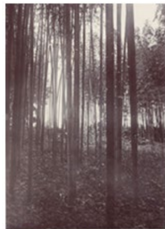
Phyllostachys bamausoides . Japan. J.G. Jack 1905.

In addition to collecting seeds and herbarium specimens representing 258 plants, Jack took photographs of individual specimens, forestry practices, and of landscape views and returned with 172 images, many of them as lantern slides, a format especially useful for his teaching. Covering some of the ground that Arboretum plant explorer Ernest Henry Wilson (1876-1930) would later visit, Jack photographed the forest preserves and activities of the lumbering industry around Mt. Fuji and elsewhere in Japan, as well as the forests of Taiwan and Korea. The scenes he captured in Beijing include formal portraits of people in traditional costumes.