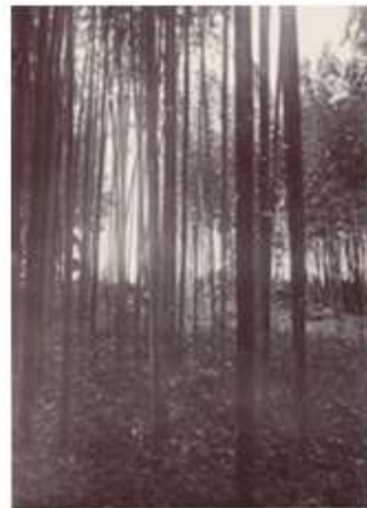
Phyllostachys bamausoides . Japan. J.G. Jack 1905.

In addition to collecting seeds and herbarium specimens representing 258 plants, Jack took photographs of individual specimens, forestry practices, and of landscape views and returned with 172 images, many of them as lantern slides, a format especially useful for his teaching. Covering some of the ground that Arboretum plant explorer Ernest Henry Wilson (1876-1930) would later visit, Jack photographed the forest preserves and activities of the lumbering industry around Mt. Fuji and elsewhere in Japan, as well as the forests of Taiwan and Korea. The scenes he captured in Beijing include formal portraits of people in traditional costumes.