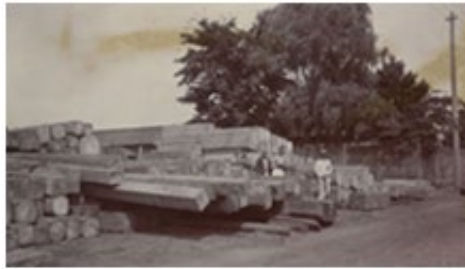
Japan - Lumbering.