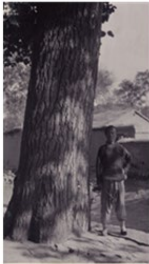
Populus tomentosa. China. J.G. Jack, 1905