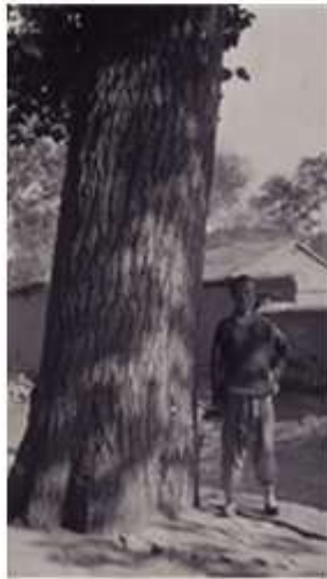
Populus tomentosa. China. J.G. Jack, 1905