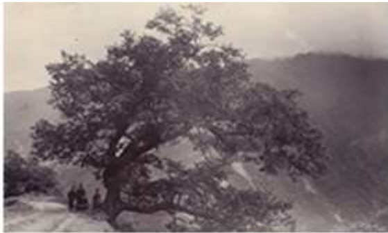
Castanea japonica . Japan. September 2, 1902.

Soon after Jack joined the Arboretum he began collecting and documenting plants in the United States and abroad. During the summers of 1898 and 1900, Jack was an agent for the U.S. Geological Survey and the U.S. Department of Agriculture. He explored the forests of central Colorado and the Big Horn Mountains of Wyoming and produced detailed documentation and photographs of the forest and soil conditions of the Pikes Peak, Plum Creek and South Platte Forest Reserves. In 1891, he visited botanic gardens in France, Germany, Italy, Denmark, and England and in 1904, he and Arboretum taxonomist Alfred Rehder (1863-1949) collected plant specimens and took photographs in the western United States and in Canada.