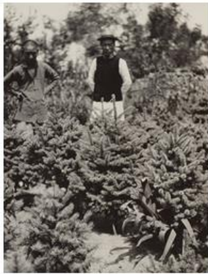
June 1, 1907