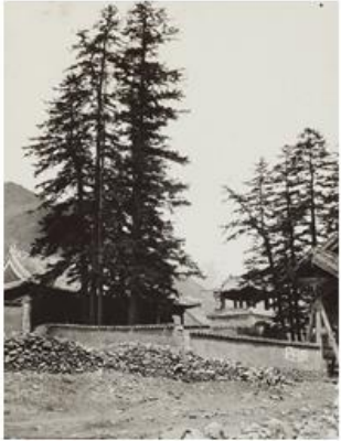
April 24, 1907