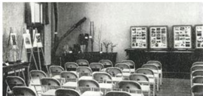
In 1955, the "lecture and demonstration" room was created on the first floor of the Hunnewell Building and the Ektachrome display panels were installed. From "Annual Report" 1955

Up until the late 1993 these illuminated wooden cases, whose lighting could be activated by the visitor, were exhibited in the Hunnewell Building either in the entrance hall or lecture hall. Upon occasion the cases were displayed at other locations outside the Arboretum in