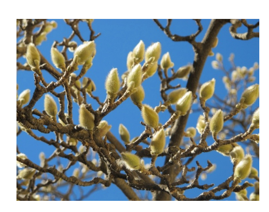
furry magnolia buds