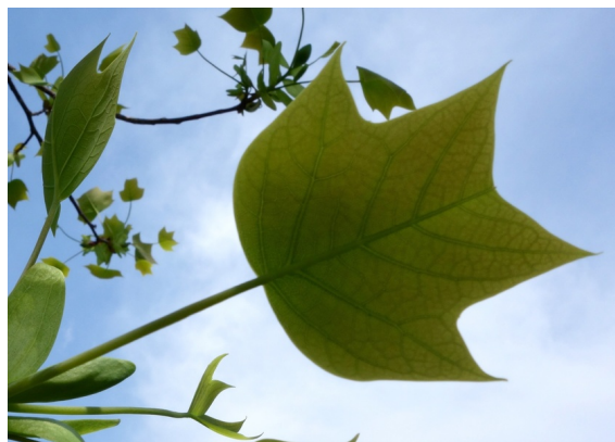
Tulip tree leaf