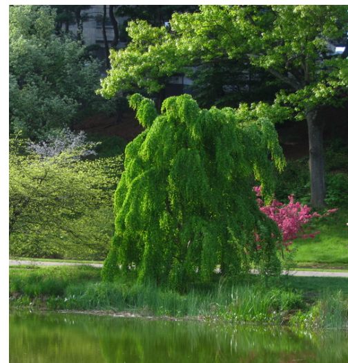
weeping Katsura tree