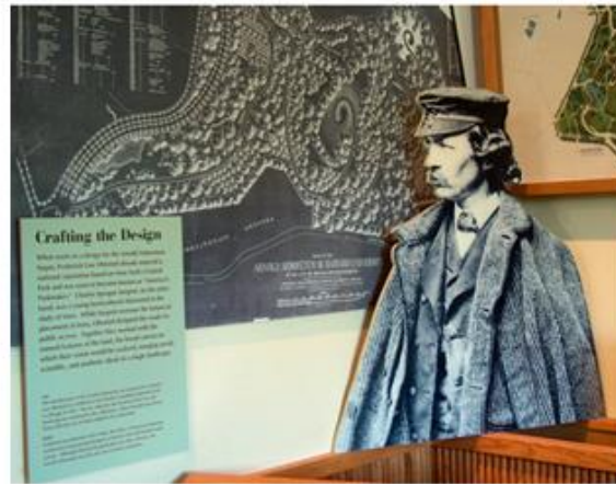
Fredrick Law Olmsted and his plan for the Arboretum