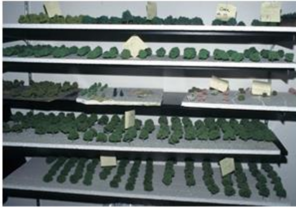
"Trees" awaiting planting

Cambridge, Massachusetts designed the exhibit, GPI Models of Boston constructed the scale model, and WB Incorporated fabricated and installed the exhibit.