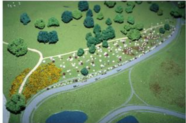
Lilac collection in "bloom"

The 8'x16' scale model of the Arnold Arboretum landscape provided a centerpiece for the exhibition and included more than 4,000 miniature trees that replicate the Arboretum's living collection. Built on a 40':1" scale, the model employed as many as 20 different shades of green. Vignettes of different eras in the Arboretum's history were featured on the model. Other parts of the exhibit highlighted the cultural history of the Arboretum, the design of the landscape, plant collecting expeditions, forest conservation, American horticulture, and the many uses of wood and the collaboration between Charles Sprague Sargent, the Arnold Arboretum's first director and Fredrick Law Olmsted, America's preminent landscape architect.