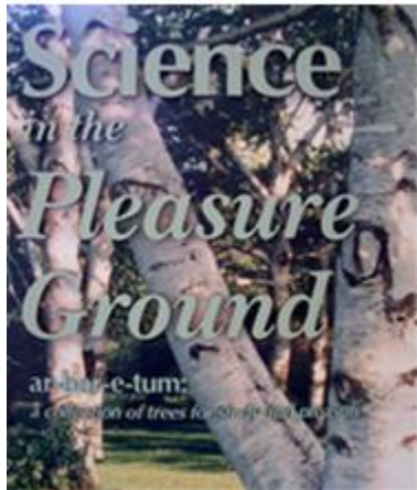
Exhibit's introductory panel

The exhibit "Science in the Pleasure Ground" opened on October 18, 1996 in the Arboretum's Hunnewell Building in celebration of the Arnold Arboretum's 125th Anniversary. A product of 6 years of planning, it highlighted the cultural history of the Arboretum, the design of the landscape, plant collecting expeditions, forest conservation, American horticulture, and the many uses of wood.