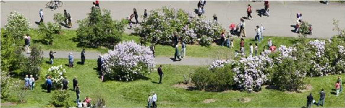
Lilac Sunday, May 13, 2007.

Series II: Photographs. Most images depict visitors walking through the lilacs, on the grounds, or in front of the Hunnewell Building.