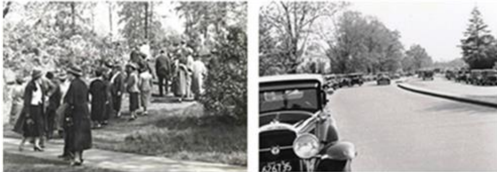
Visitors enjoying the lilacs ( on left ) and parking on Centre Street ( on right ) during Lilac Sunday, 1936, both photographs by Donald Wyman

Series IV, Historical Press Coverage, contains materials located in Arnold Arboretum Scrapbook 7. For more information on scrapbooks, please contact the library.