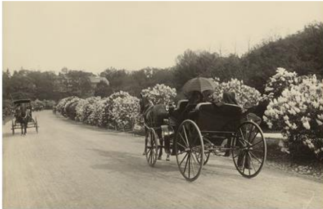
Lilacs, Spring. May 23, 1908

On May 25, 1908, when the Boston Daily Globe published the headline "LILAC SUNDAY AT ARNOLD ARBORETUM" the first record of what would become an annual celebration, as well as its signature name, was created.