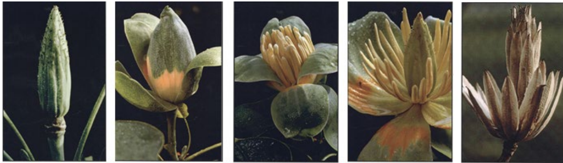
Liriodendron tulipifera (Tulip Tree)