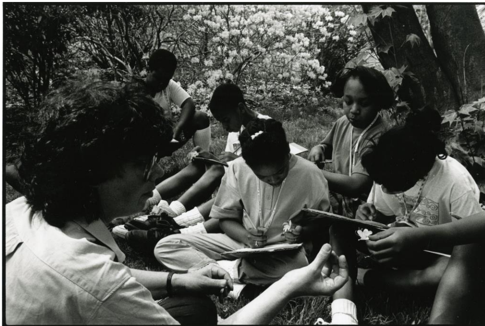
Image 1: Students from the Joseph Lee Elementary School during an FSE, May 1992.

See also: http://arboretum.harvard.edu/educators/field-study-experiences/