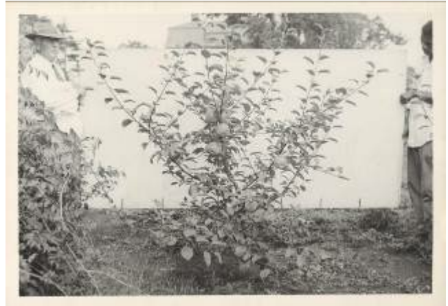
Photographs of dwarfing experiments. McIntosh/ Malus sargentii 'Rosea'/ Malus sikkimensis knotted cross at 4 years (right). 1950s