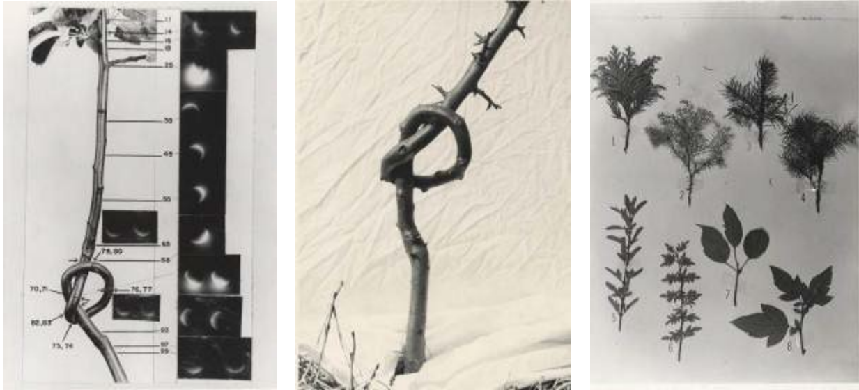
Dwarfing experiment, undated (left); Malus dwarfing experiment, 1951 (center); "Juvenile Foliage", 1958 (right)