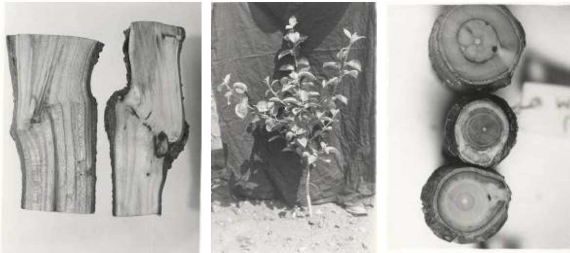
Photographs of dwarfing experiments from Box 15, Envelope 2. Unlabeled, undated. 1950s