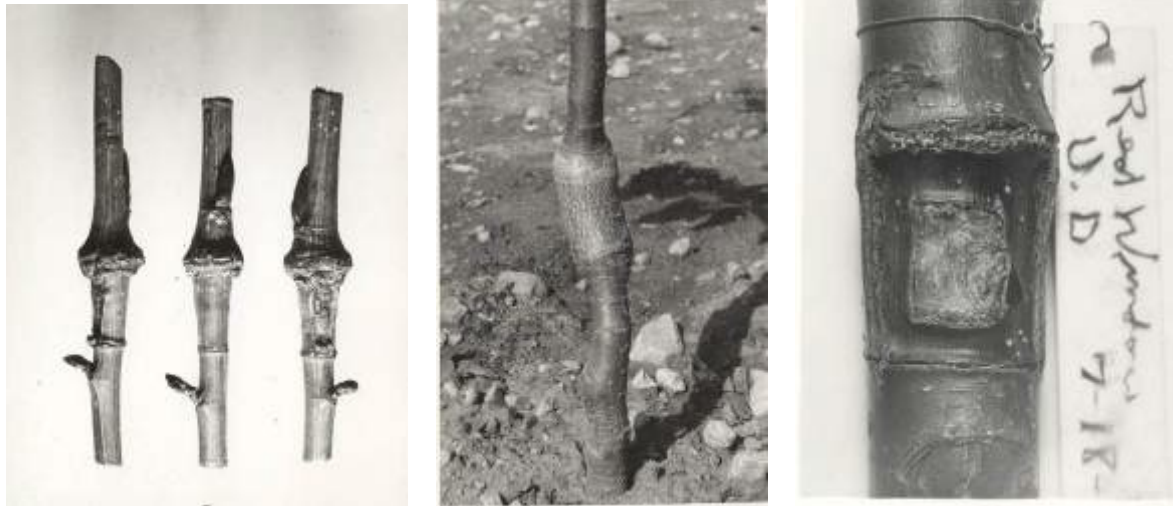
Photographs of dwarfing experiments from Box 15, Envelope 2. Unlabeled, undated. 1950s