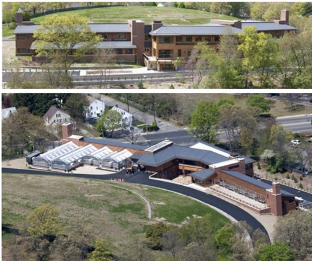
Weld Hill Research Building opened in January 2011 to house the Arboretum's science program and associated staff and administrators