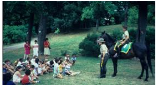
Mounted Park Rangers at the Arnold Arboretum, undated