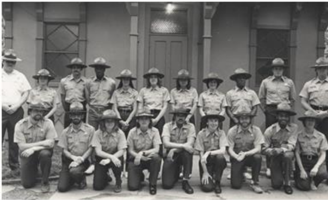
Boston Park Rangers 1983

The late 1970s and early 1980s saw an upswing in violence and vandalism in Boston, which led to a subsequent drop-off in visitation to city parks. Responding to the growing concern for Boston's parklands, in 1982, under the aegis and management of the Boston Parks and Recreation Department, the Massachusetts Association for Olmsted Parks, The National Association for Olmsted Parks, Friends of the Public Garden