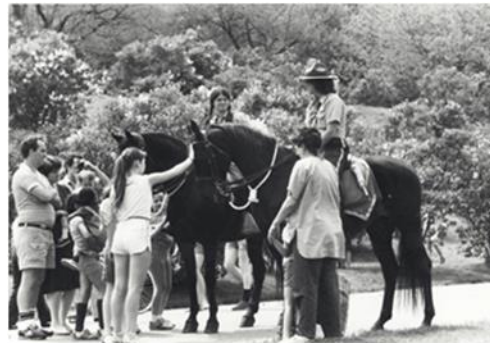
Mounted Park Rangers at the Arboretum 1983

The Boston Park Rangers program was based on the urban ranger program in New York City and operated seasonally from 1982 until 1988. During the first year, Boston Park Rangers patrolled the Boston Common, the Public Garden, the Commonwealth Avenue Mall, and the Arnold Arboretum. That first year the Boston Park Ranger Mounted Unit, which was established through a coordinated effort with the Boston Police Department and the Boston Parks and Recreation Department, patrolled the Arboretum on horseback. In the following years the Ranger program was expanded to include Franklin Park, Jamaica Pond and the Back Bay Fens.