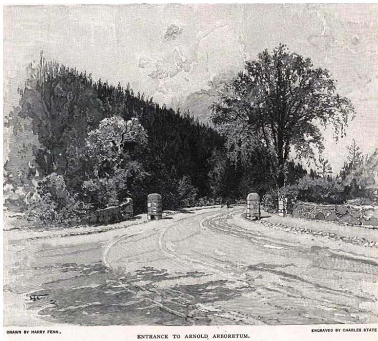
"Entrance to Arnold Arboretum"