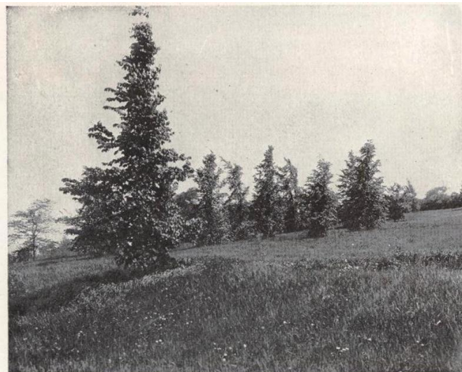
Unique method of planting native trees at the Arboretum. The specimen tree in the foreground stands apart and has every chance to develop on all sides. The group will approximate forest conditions. The trees are young rock elms ( Ulmus racemosa ).

From Vilhelm Miller, 1904. "The world's greatest tree garden." Country Life in America , page 386