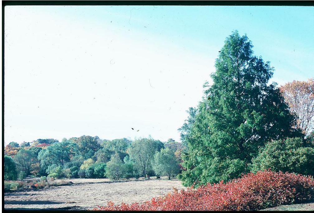
North Meadow with a Dawn Redwood (524-48*AA) on the right, Arnold Arboretum. October, 1980