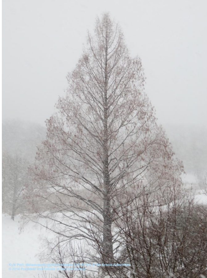
Metasequoia glyptostroboides , Arnold Arboretum. Photograph by Kyle Port, February 13, 2014.