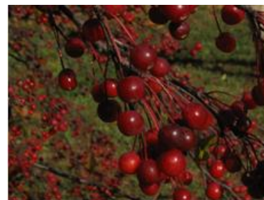
Malus 'Donald Wyman' 23254*A