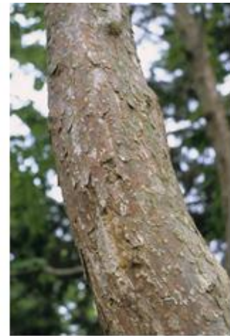
Davidia involuocrata var vilmoriniana