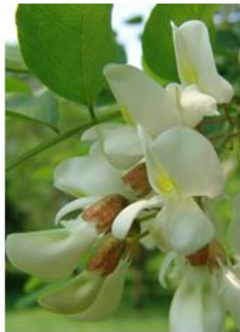
Robinia pseudoacacia 'Burgundy'