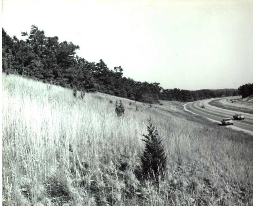
April-June 1975 Cover of Trees Magazine , Fordham Cover picture.