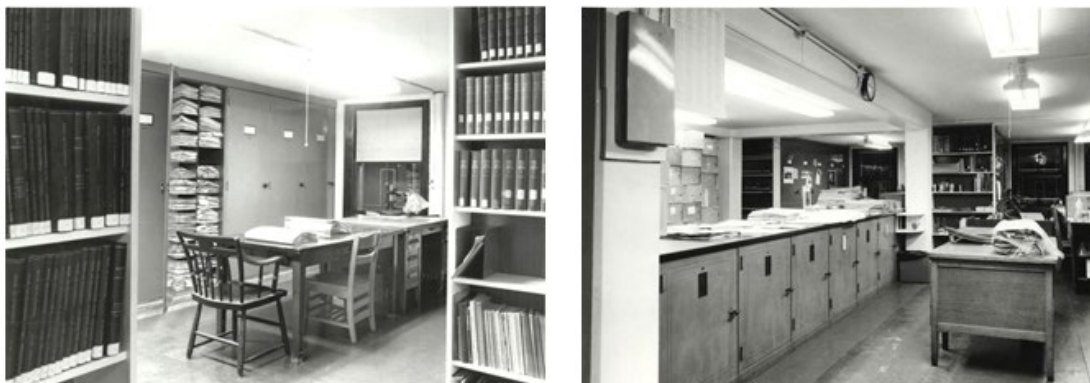
Arnold Arboretum Herbarium, second floor Hunnewell Building, January 7, 1991.