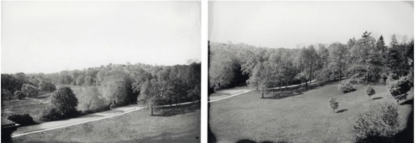
Two images of the Arboretum's Meadow Road and adjacent meadow taken by Raup from the roof of the Herbarium Wing possibly to be used in his article on the history of the meadow area. From Series II, Folder 5