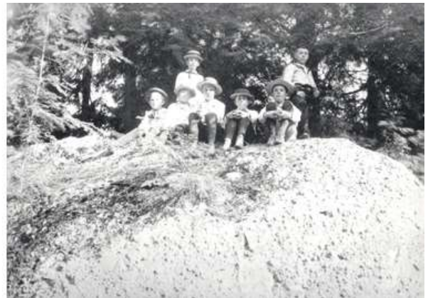
An outing of six young, unidentified boys to two locations on Hemlock Hill, original images may have been re-photographed by Raup. From Series III, Folder 4