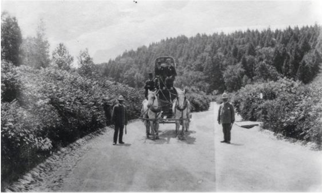
Raup may have reproduced this image of Valley Road with Hemlock Hill in the background. The image clearly shows the cobble gutters and a ramp on the right hand side that enables vehicle access to the collection. The ramp may be positioned at the site of "Rockery Spring." From Series III, Folder 4