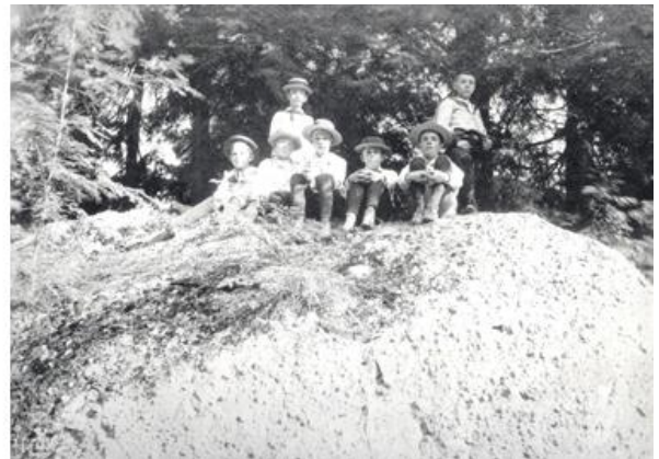
An outing of six young, unidentified boys to two locations on Hemlock Hill, original images may have been re-photographed by Raup. From Series III, Folder 4