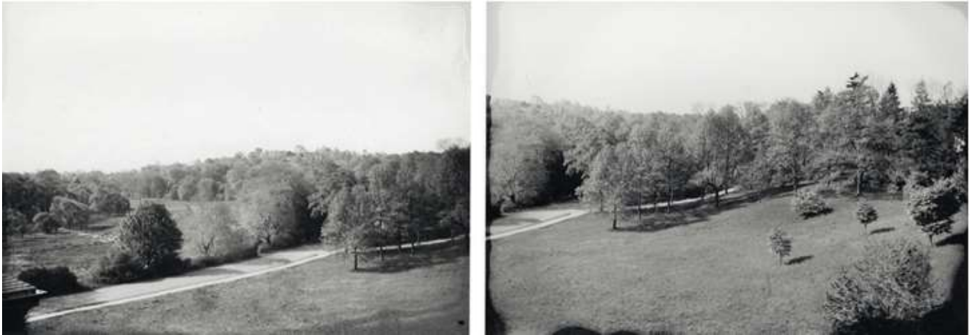
Two images of the Arboretum's Meadow Road and adjacent meadow taken by Raup from the roof of the Herbarium Wing possibly to be used in his article on the history of the meadow area. From Series II, Folder 5