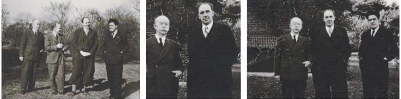
These three images of Alfred Rehder with unidentified men were likely taken by Raup in the 1930s. From Series III, Folder 6