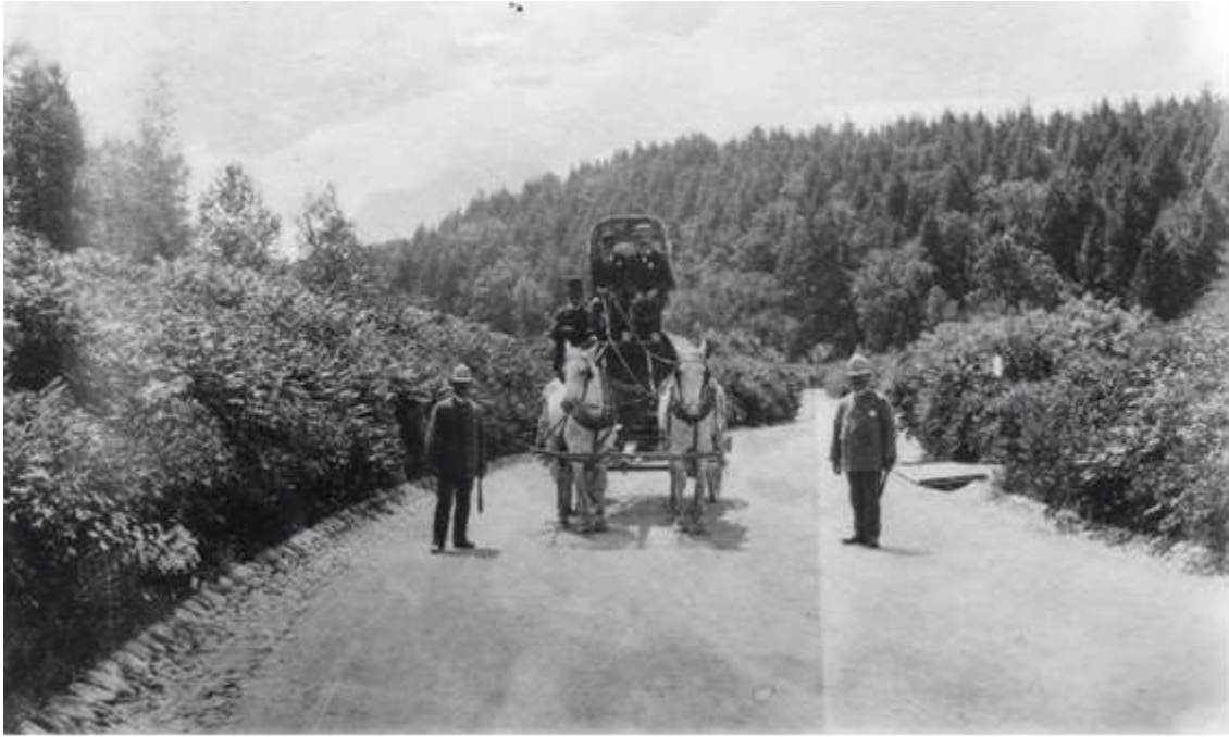
Raup may have reproduced this image of Valley Road with Hemlock Hill in the background. The image clearly shows the cobble gutters and a ramp on the right hand side that enables vehicle access to the collection. The ramp may be positioned at the site of "Rockery Spring." From Series III, Folder 4