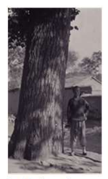
Populus tomentosa. China. J.G. Jack, 1905