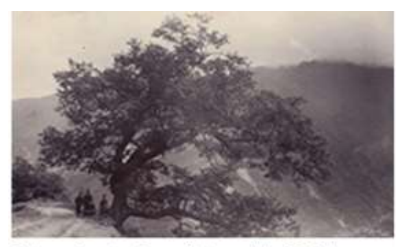
Castanea japonica. Japan. September 2, 1902.

Soon after Jack joined the Arboretum he began collecting and documenting plants in the United States and abroad. During the summers of 1898 and 1900, Jack was an agent for the U.S. Geological Survey and the U.S. Department of Agriculture. He explored the forests of central Colorado and the Big Horn Mountains of Wyoming and produced detailed documentation and photographs of the forest and soil conditions of the Pikes Peak, Plum Creek and South Platte Forest Reserves. In 1891, he visited botanic gardens in France, Germany, Italy, Denmark, and England and in 1904, he and Arboretum taxonomist Alfred Rehder (1863-1949) collected plant specimens and took photographs in the western United States and in Canada.