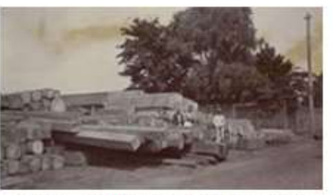
Japan - Lumbering