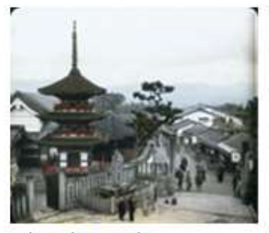
Kiyomizu at Kioto