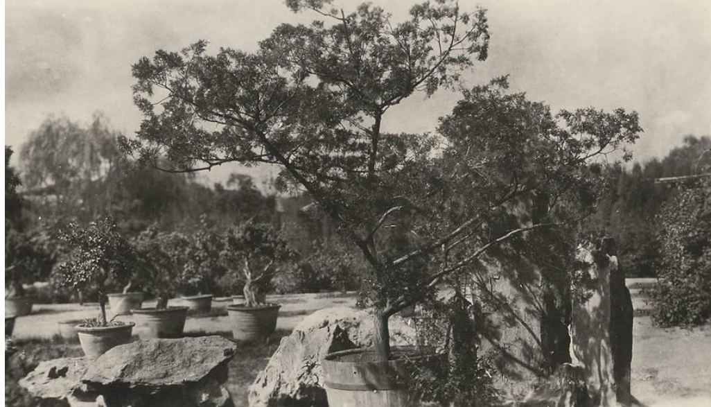
Juniperus chinensis . Honan, China. c1923