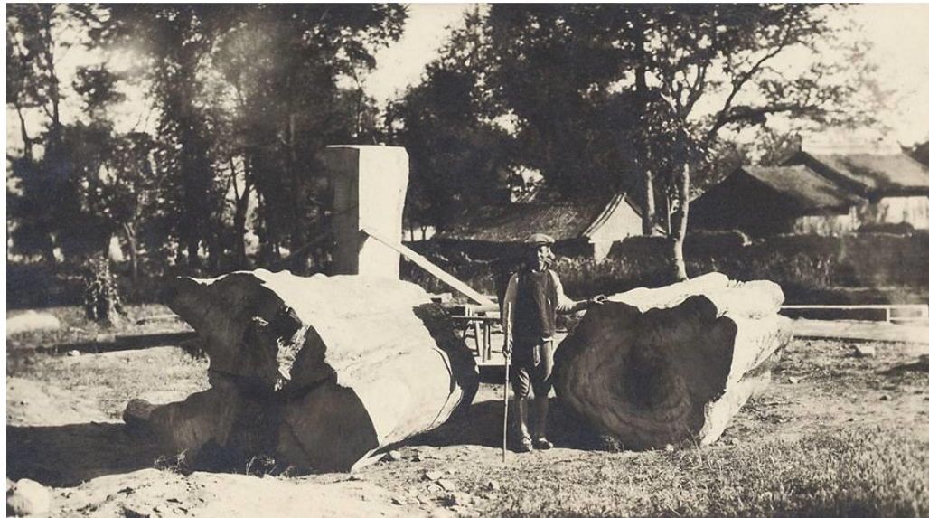
Ailanthus altissima . China. 1919

Correspondence between Joseph Hers and Charles Sprague Sargent can be found in Charles Sprague Sargent's letterbooks, IB CSS, Series II, Box 9: (8/27/1919, p. 431, and 9/12/1919, p. 455). Letters between Joseph Hers and Charles Sprague Sargent are also housed in Sargent's Pre-1927 Correspondence file.