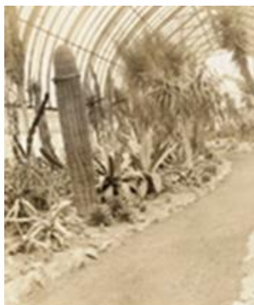
Missouri Botanical Garden E.J. Palmer 4/3/1924