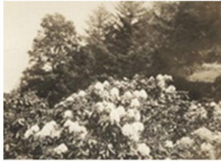
Rhododendrons Hemlock Hill June 1923