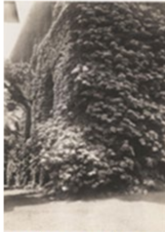
Hydrangea petiolaris Hunnewell Building E.J. Palmer 6/20/1947