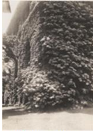
Hydrangea petiolaris Hunnewell Building E.J. Palmer 6/20/1947