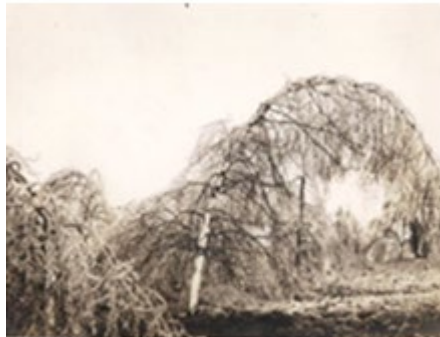
Birches after a sleet storm Arboretum E.J. Palmer n.d.