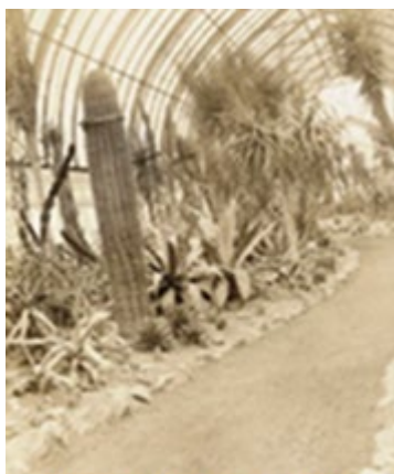
Missouri Botanical Garden E.J. Palmer 4/3/1924