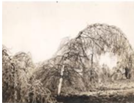
Birches after a sleet storm Arboretum E.J. Palmer n.d.