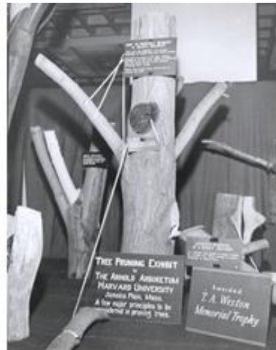
Pruning exhibit displayed in the Arboretum's lecture hall and at Massachusetts Horticultural Society's Annual Spring Flower show.