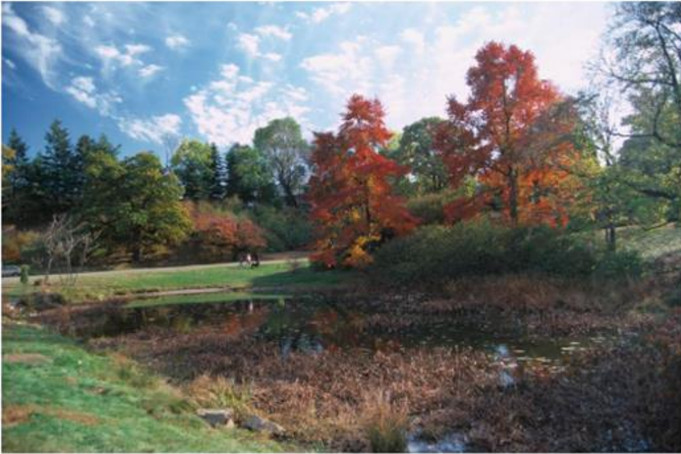
Fall view of ponds