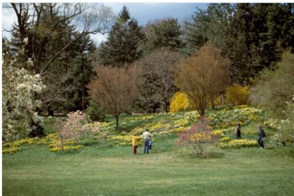
Daffodil bank near Visitors Center, Click to see more