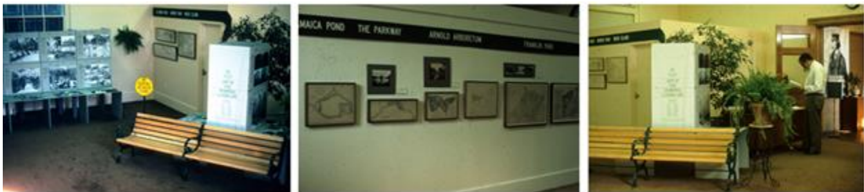
Images of the exhibition Art of the Olmsted Landscape: His Work in New York City