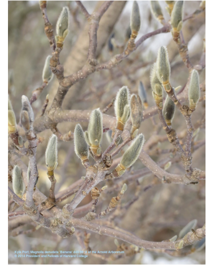
furry flower bud