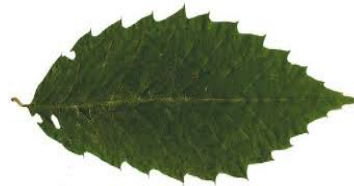
leaf with teeth