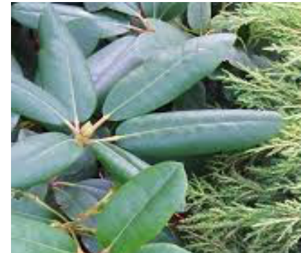
broad evergreen leaf