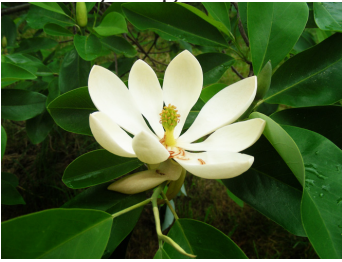
2. Stewartia pseudocamellia