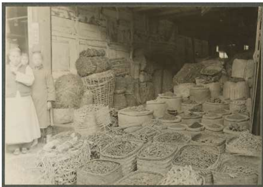
2 R-144. China, Sze-chuan (Chong-pa). Interior of a medicine shop. March 24, 1925

March 23. Left mission house at 6:30 accompanied by 100 soldiers. Seventy marched ahead of the caravan, 30 brought up the rear. Passed fields of Wheat; Peach & Pear trees in bloom: noticed Daphne, Cypress, Roses, Berberis, Violets . At Chang ming, 75 li from Mienchow, a new assignment of soldiers awaited their arrival. Continued through fields of Aconitum wilsonii and "other medicinal plants", Indigo strobilanthea faccidifolia, Rape . To the mission compound at Chungpa, a great medicine center.