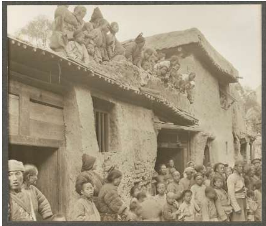
3 R-101. China, Kan-su (Kai-chow). The main street in Kai-chow. April 8, 1925

Continued up the Wu to river to village of Sha hu tze. Conglomerate rock in the banks of stream with granite and quartz; no vegetation. Top of some mountains covered with Fir trees. To village of Chyo kung. Problems with mulemen and soldiers. Sent letter to commanding officer asking for replacements. Threatened to contact American legation in Peking.