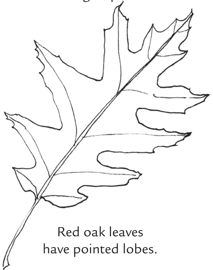
Red oak leaves have pointed lobes.