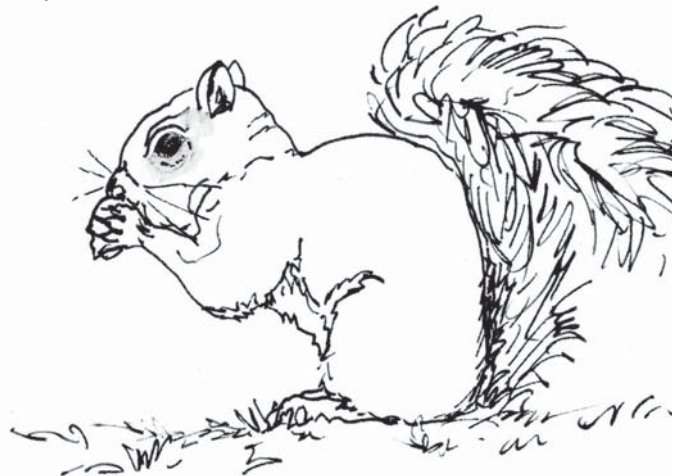
Gray squirrels eat acorns.